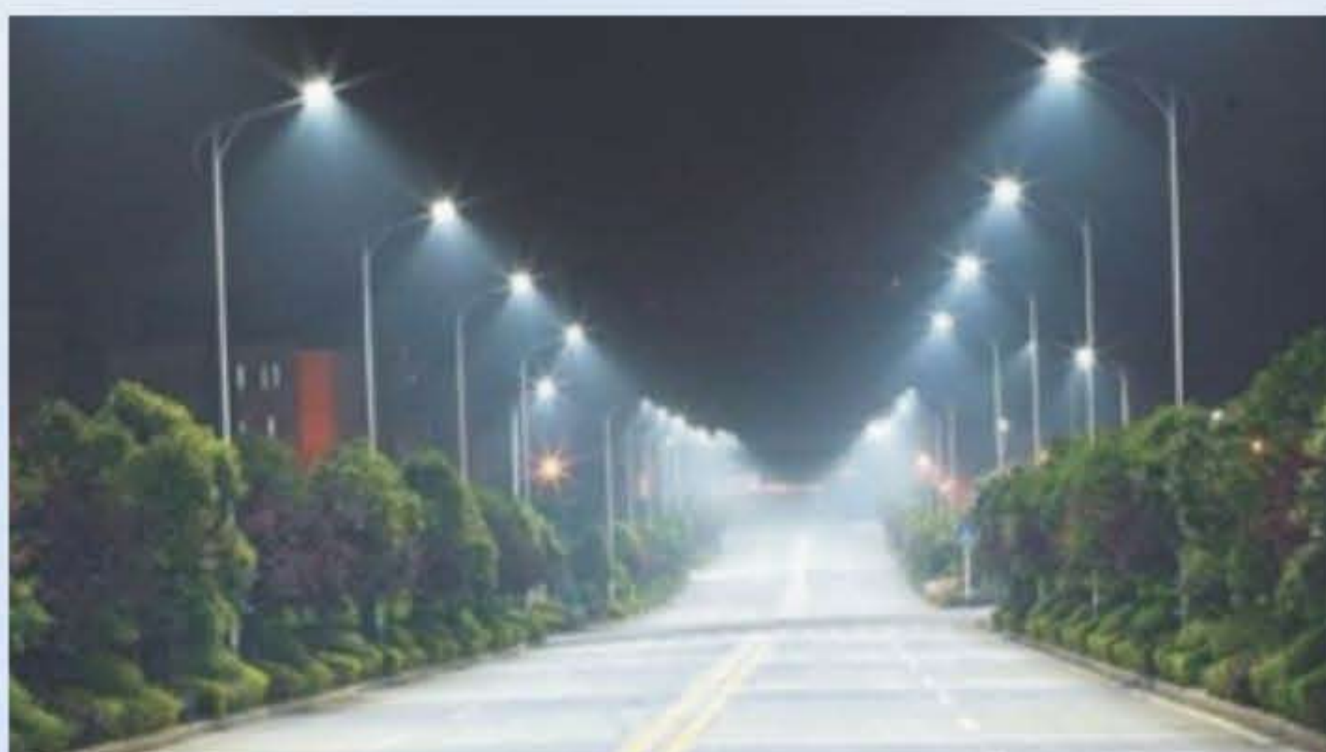
LED Street Lights