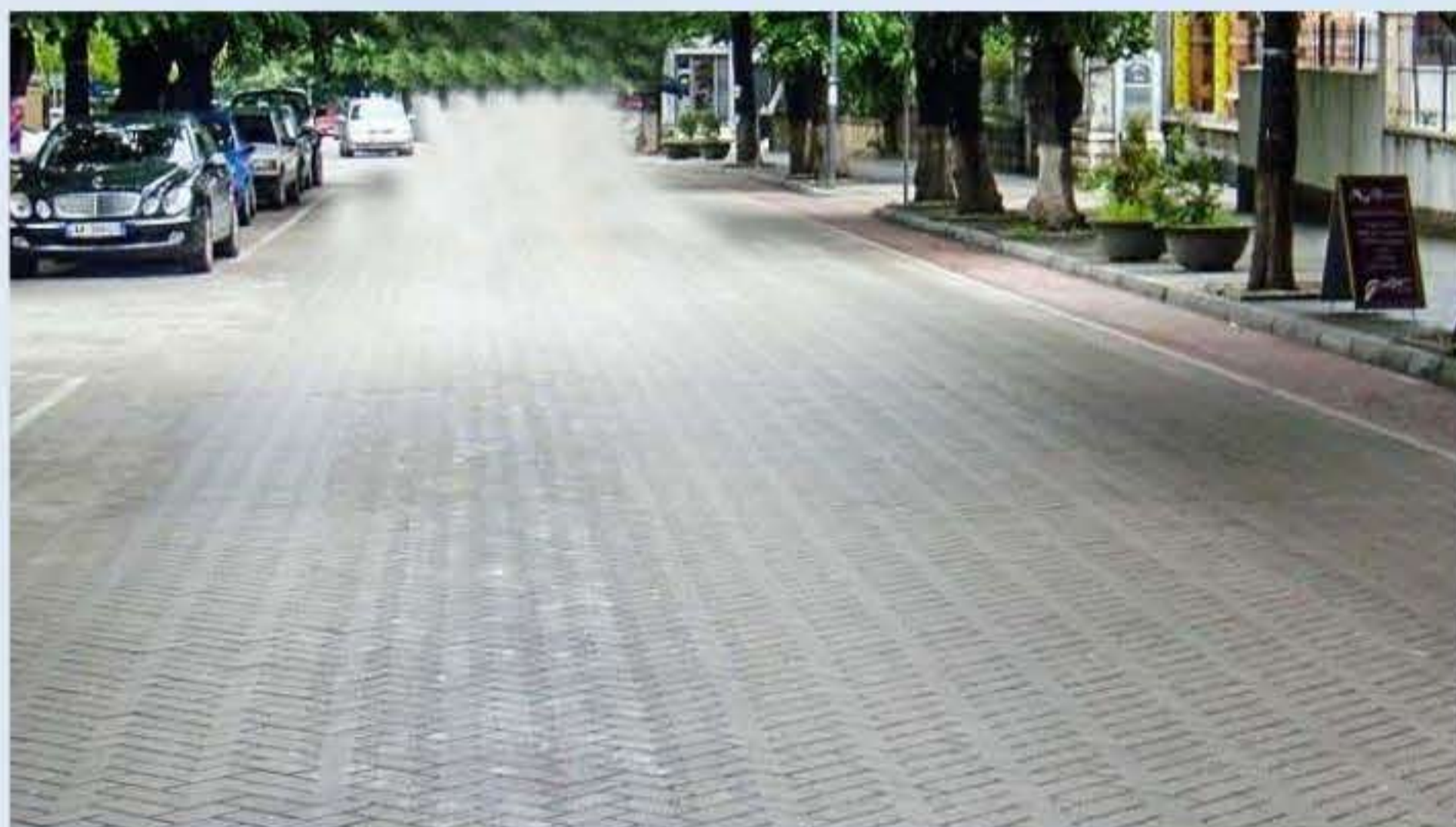
RCC Paved Roads

Adjoining fully functional Ansal Town, Alwar